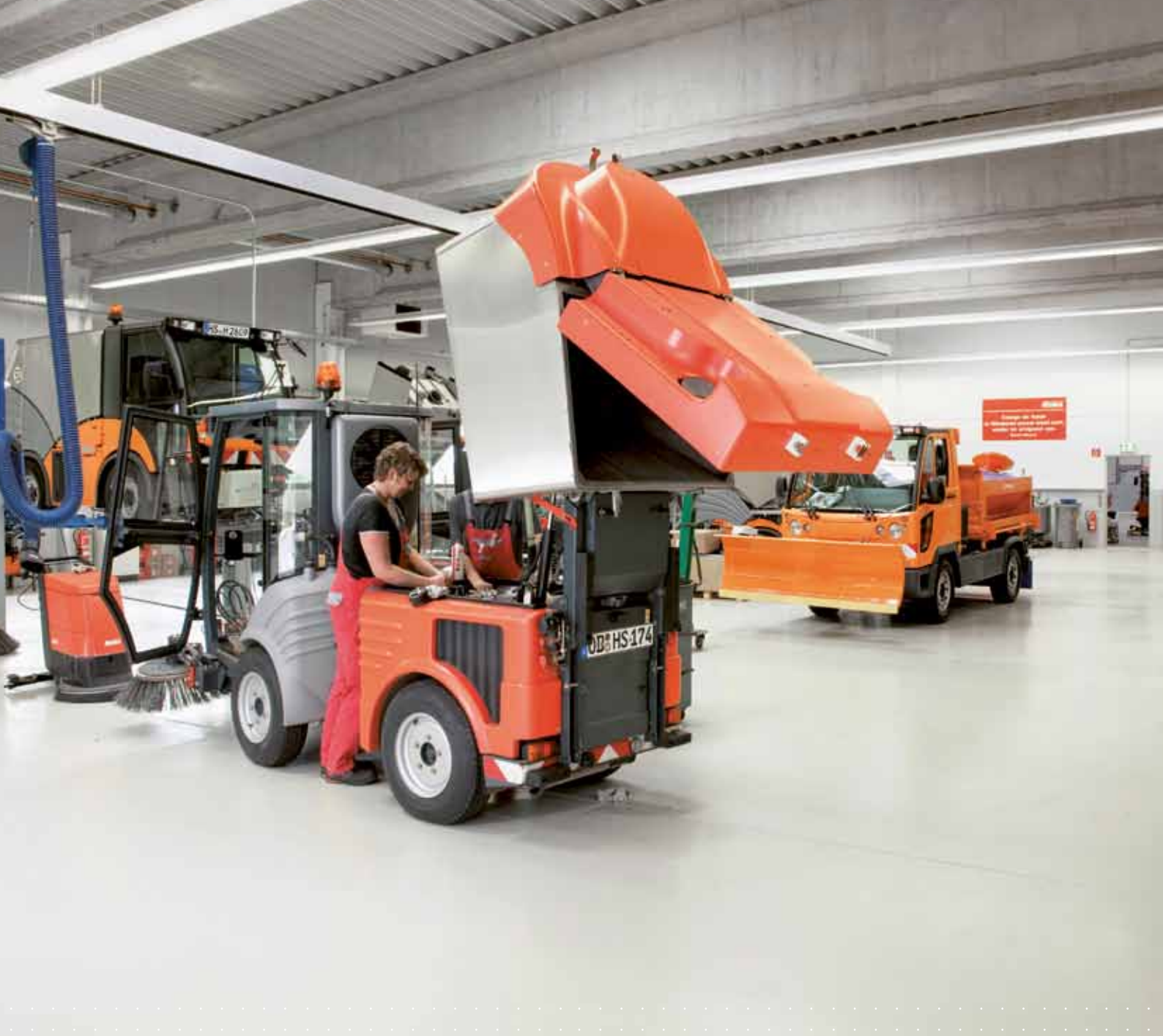
cds coating HB for workshops and industry, Hako GmbH, Germany