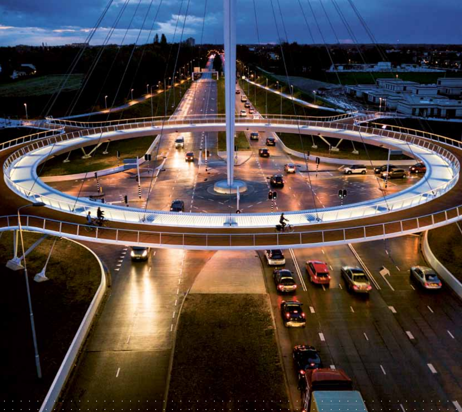
cds bicycle path coating on a tubular steel bridge, Eindhoven, NL